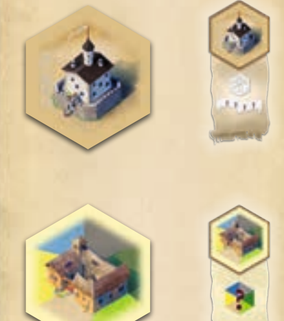
Example: When you place an inn in a size 4 area, it is increased to a size 5 area and will score 15 instead of 10 victory points when completed.

Important: By placing an inn, you increase the size of that area by 1, to an absolute maximum of 8.